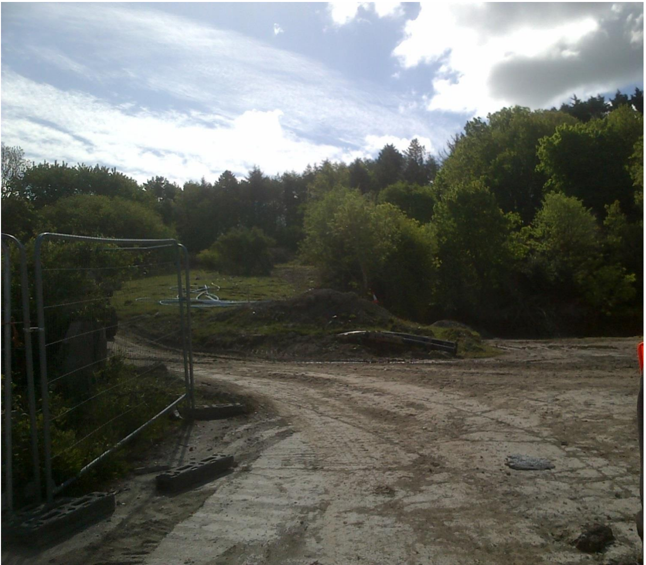
TPO 506 viewed from inside the site