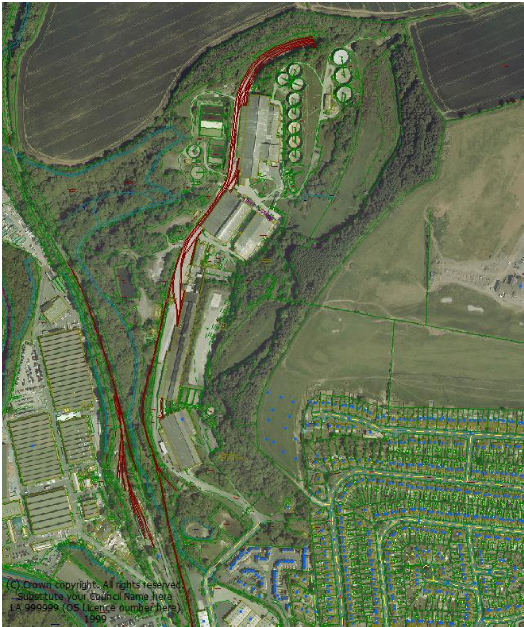
Aerial image of former China Clay Marsh Mills Works, Coypool